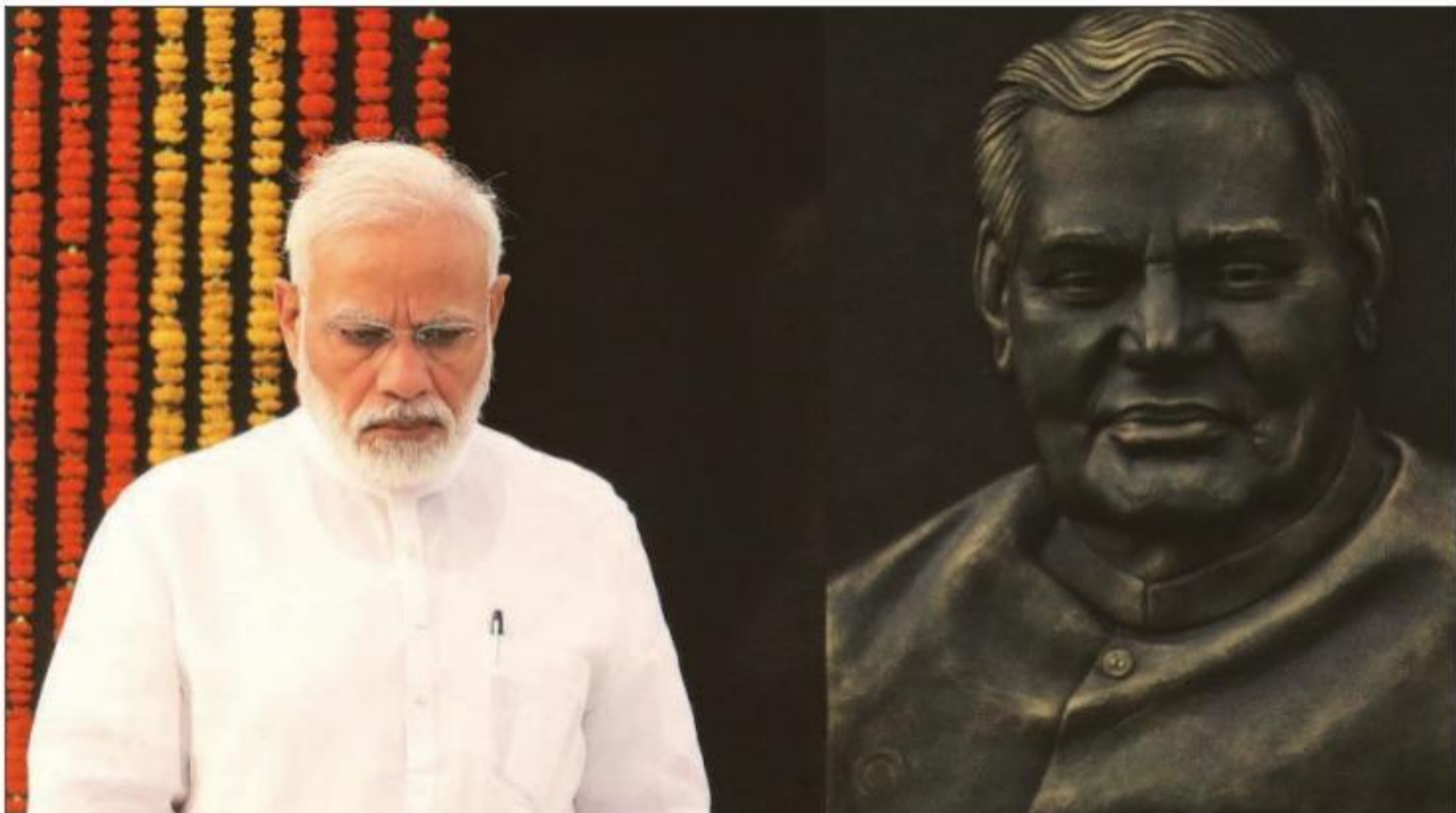
Prime Minister Narendra Modi pays tribute to former PM Atal Bihari Vajpayee on his first death anniversary at his memorial in New Delhi on Friday.