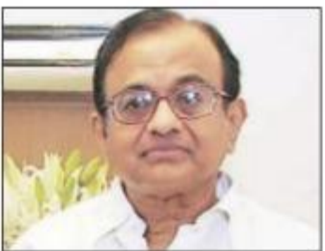
'Population control and avoidance of single-use plastic must become people's movements'

Taking a dig at the government, he stated in another tweet, "I hope the Finance Minister and her legion of tax officials and investigators heard the PM's sec-