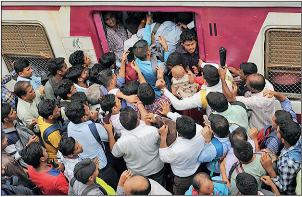
BURSTING AT THE SEAMS?

TNN & AGENCIES New Delhi: Prime Minister Narendra Modi’s exhortation for population control in his Independence Day speech drew varied reactions from the political class with Congress leader P Chidambaram welcoming it and Shiv Sena using the comment to target the Muslim community. AIMIM chief Asaduddin Owaisi weighed in and claimed that PM Modi was coming up with “discarded and intrusive” ideas of governance. Chidambaram hailed Modi’s announcement and said, “All of us must welcome three announcements made by the PM on I-Day: Small family is a patriotic duty, respect wealth creators and shun single-use plastic. The first and third exhortations must become people’s movements. There are