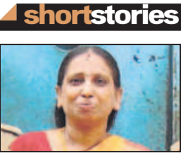
• Nalini Sriharan