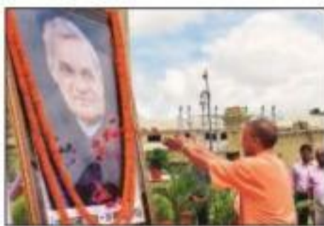
Yogi Adityanath pays tribute in Lucknow.

Later in the day, a government statement said that these residential schools would be meant for children of labourers.